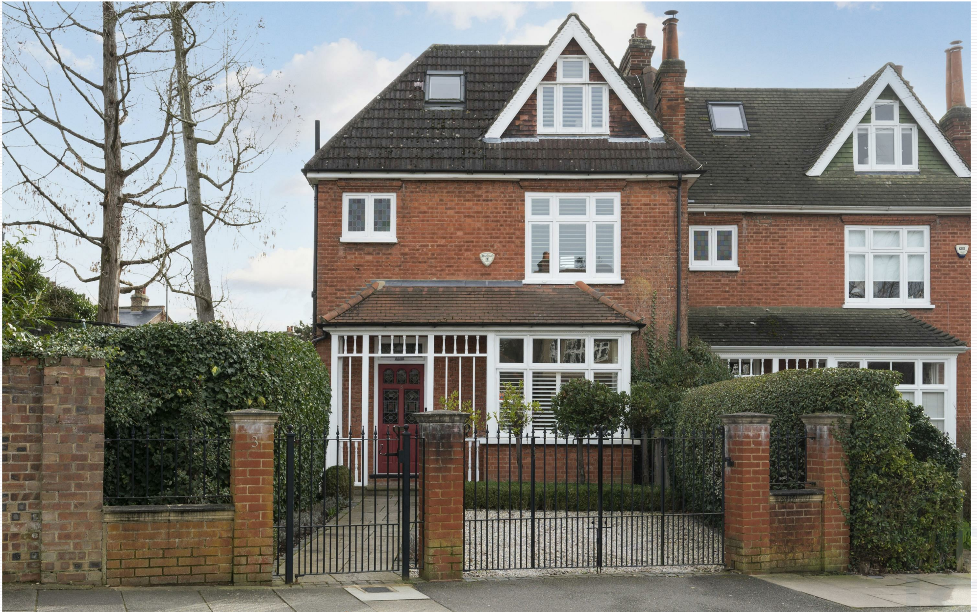
Cambridge Road, West Wimbledon, SW20 0SQ